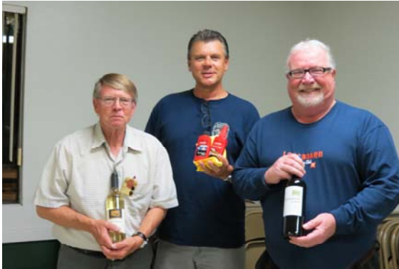
Clean Car Contest